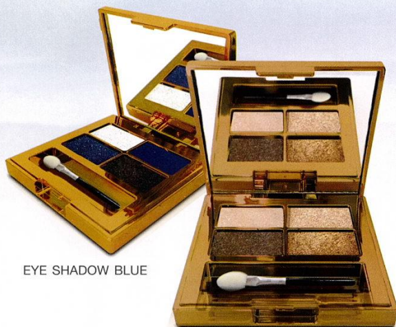
EYE SHADOW BLUE